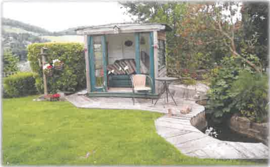
WEST ELEVATION OF EXISTING SUMMER HOUSE