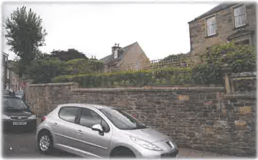
VIEW FROM LAWYERS BRAE