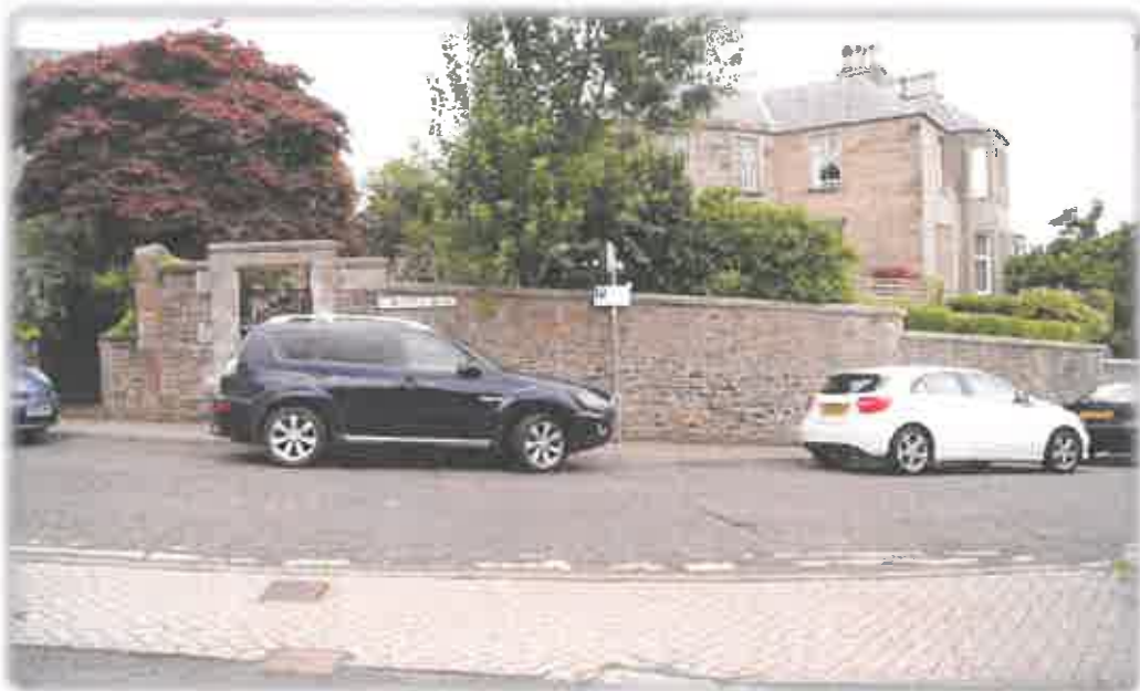
VIEW FROM LAWYERS BRAE