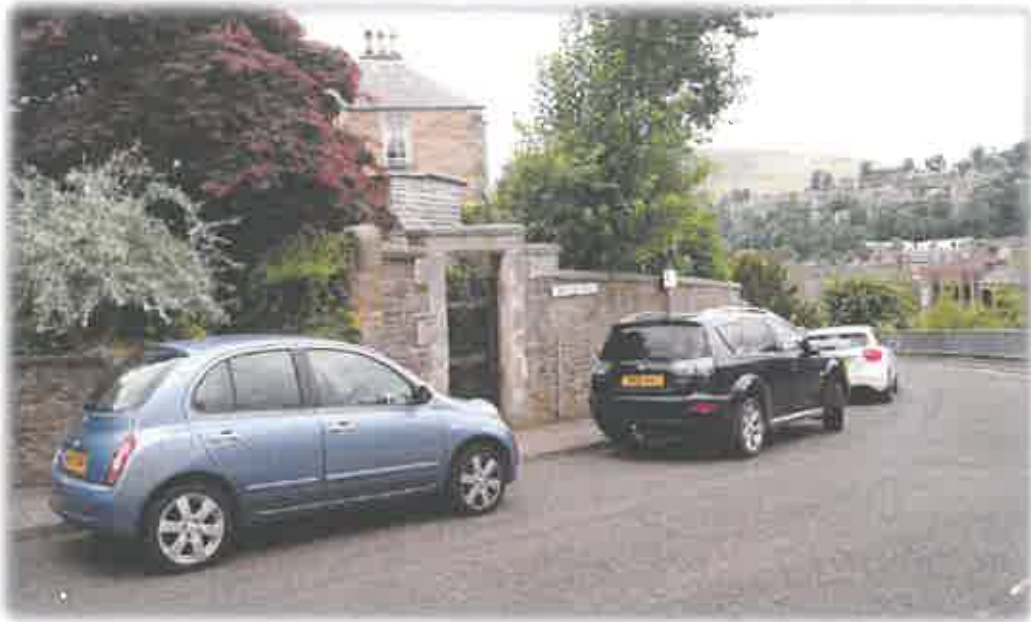
VIEW FROM LAWYERS BRAE