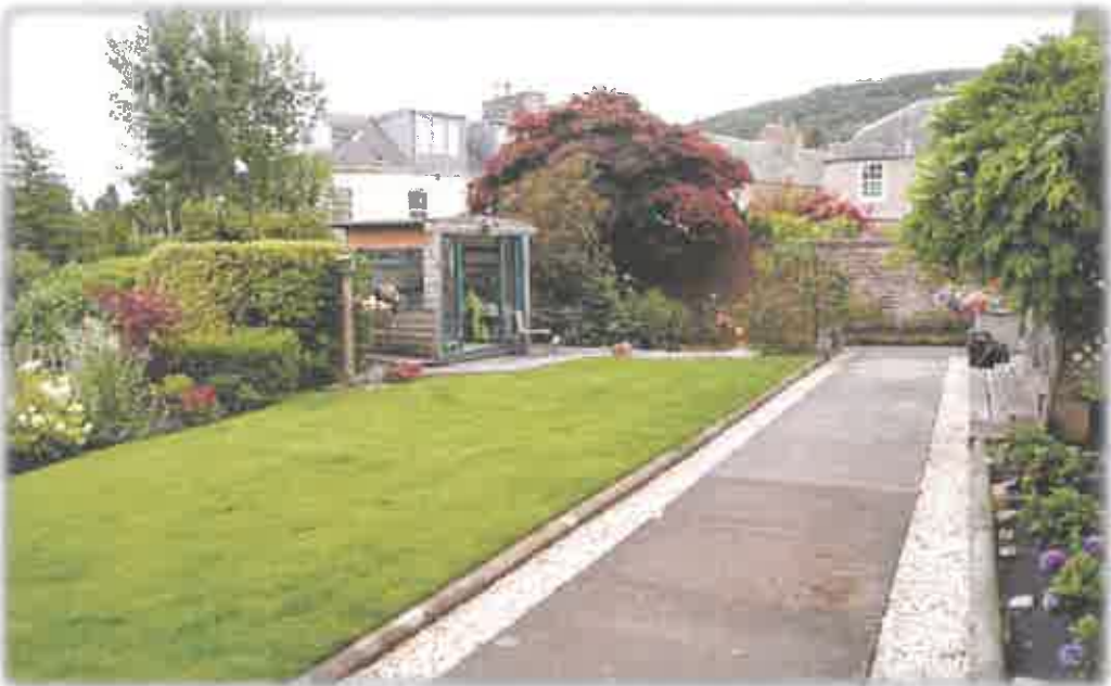
NORTH ELEVATION OF EXISTING SUMMER HOUSE